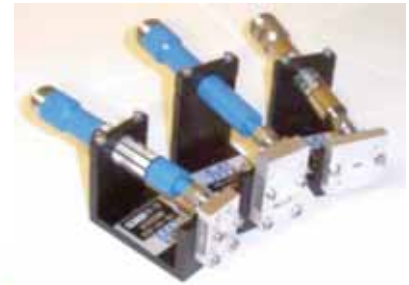
MI-3372, MI-3373 and MI-3374 Mixers.